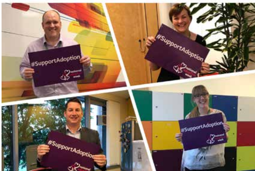
Staff supporting National Adoption Week (above) and Foster Care Fortnight (below)