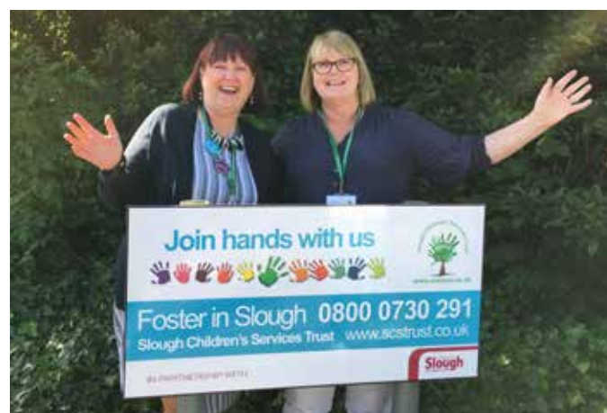
Our teams have been out and about, meeting local communities and promoting our fostering services