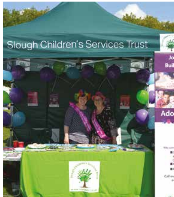
We've attended more than 50 local events this year, all over Slough and beyond